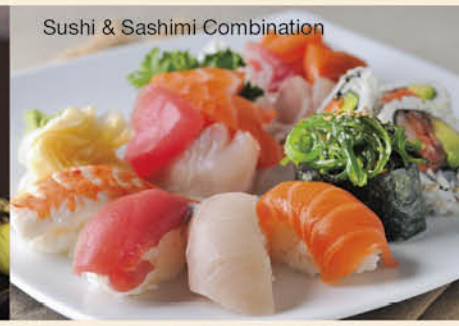
Sushi & Sashimi Combination