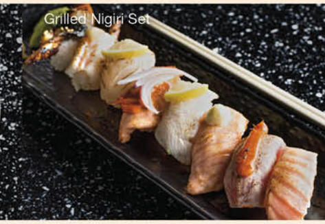
Grilled Nigiri Set